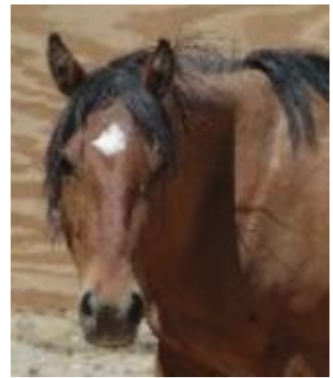
Wilson Creek Wild Horse